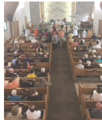
Choir view of Easter worship